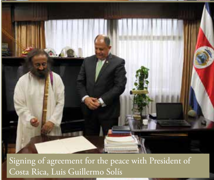
Signing of agreement for the peace with President of Costa Rica, Luis Guillermo Solís