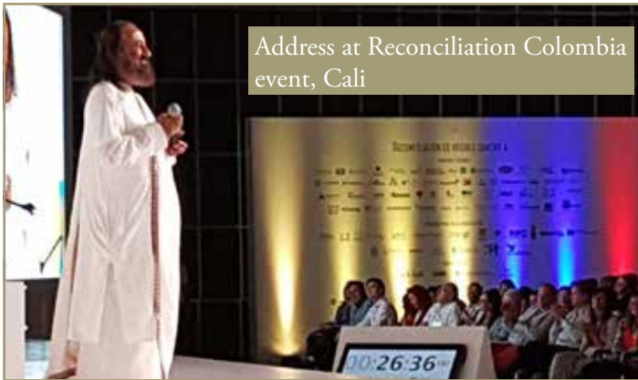
Address at Reconciliation Colombia event, Cali

His public programs in San Salvador, Nicaragua, Guatemala, Costa Rica, Panama and Brazil were packed to capacity. From November 29 to December 19 Sri Sri also launched volunteer campaigns across many cities and urged people to put in one hour a day in the service of society. The campaigns will take up projects in the areas of improving protection of women, fighting corruption and reducing crime among others.