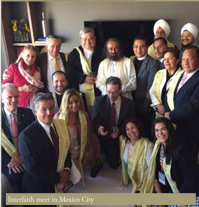
Interfaith meet in Mexico City