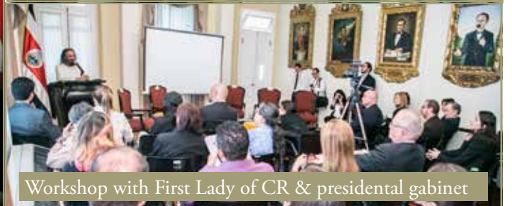
Workshop with First Lady of CR & presidential gabinet