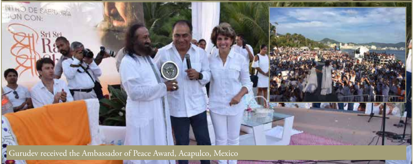
Gurudev received the Ambassador of Peace Award, Acapulco, Mexico