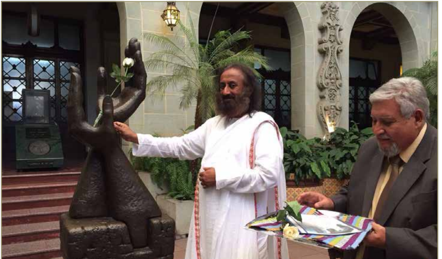
'Change the Rose of Peace' event in Guatemala City by the Ministry of Culture - an honor accorded previously only to peacemakers like the Pope and Mother Teresa