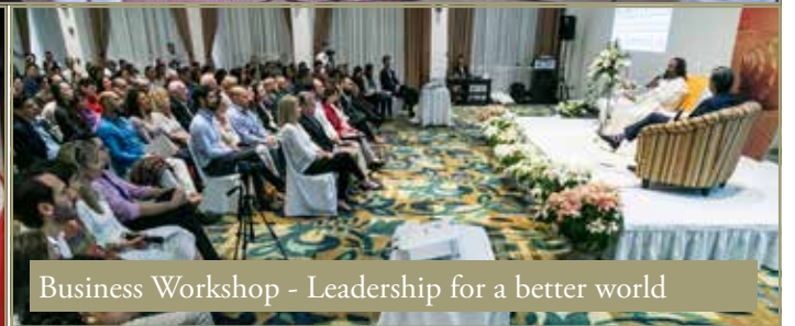
Business Workshop - Leadership for a better world